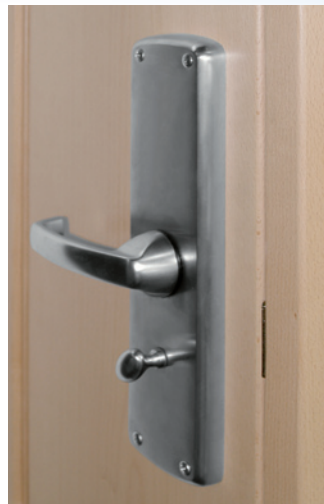
Interior door furniture