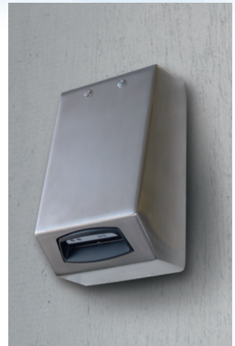
Wall-mounted reader for commonly used areas

Gretsch-Unitas GmbH Baubeschläge Johann-Maus-Str. 3 D-71254 Ditzingen Tel. + 49 (0) 71 56 301-0 Fax + 49 (0) 71 56 301-293 www.g-u.com