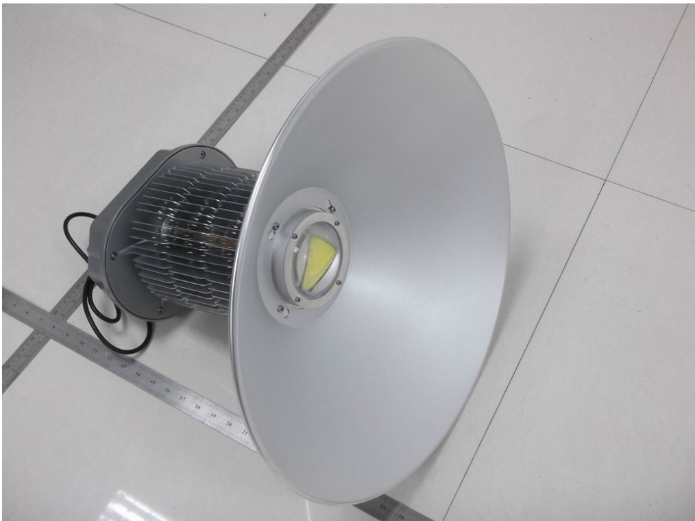
Fig. 2 Overview