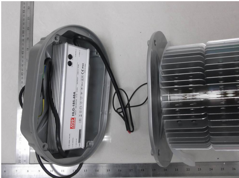
Fig. 4 Inside view