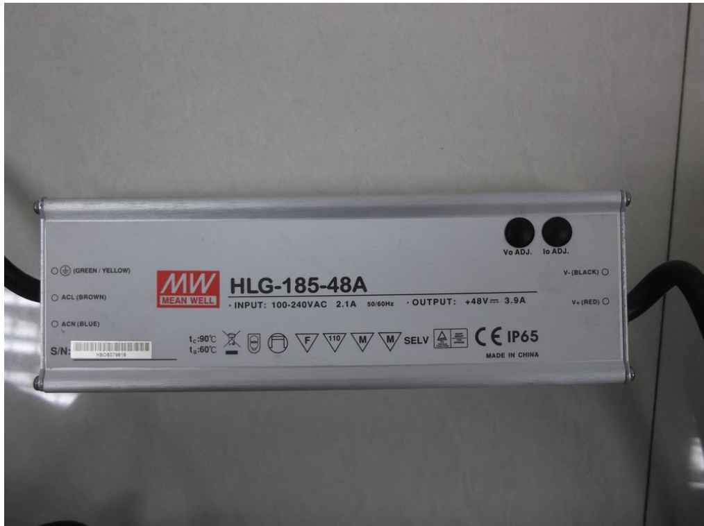
Fig. 5 LED driver view