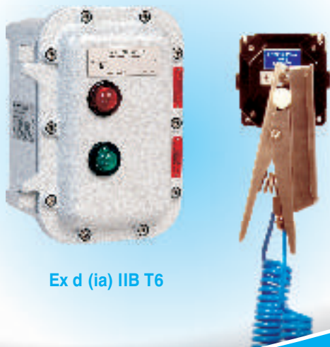
Ex d (ia) IIB T6

The Earth-Rite RTR ™ Static Earthing System is designed specifically for road tankers with rubber tyres. For dedicated loading/unloading of Rail Cars or other conductive mobile tanks, IBC totes and drums the standard Earth-Rite PLUS system with Single Mode (Earth resistance monitoring) is available. For complete flexibility in mixed loading applications specify the Earth-Rite RTR ™ with additional Mode Selector Key Switch.